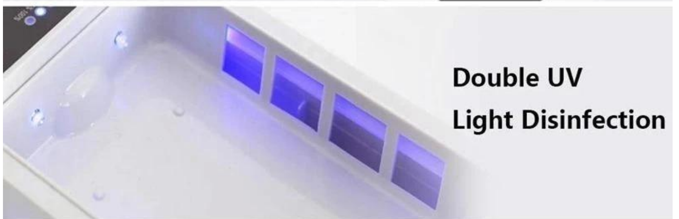
Double UV Light Disinfection