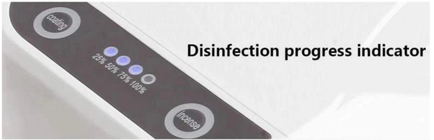
Disinfection progress indicator