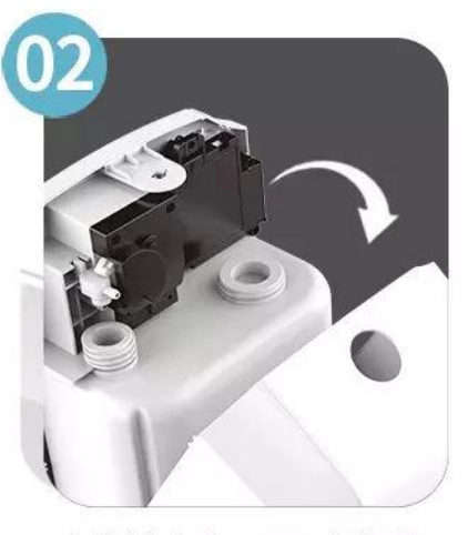
2. Rotate the top groove button to open the phone washer cover