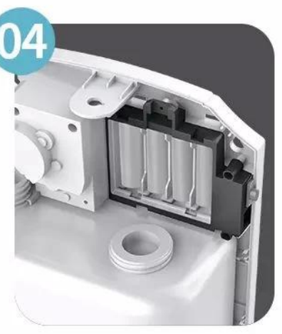
4. Use 4x1.5V "AA" AA batteries for power supply, and the battery installation position is as shown above