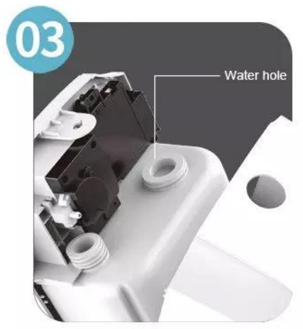
3. Pull off the cap of the water pipe, the water bottle can be filled with 2200ml of liquid; please press the pump head a few times to expel excess air for the first use