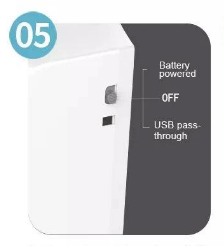
5. Turn on the switch, as shown in the figure; the function of switch three gears is as shown in the figure above