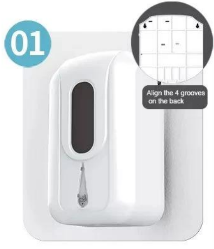
1. Use the accessory hook to wash the phone hanging on the wall