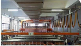
Pattern Plating Machine