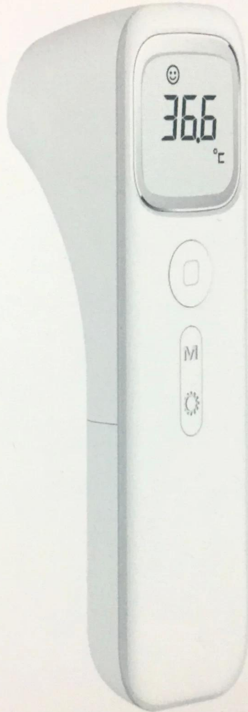
DY-A200 INFRARED THERMOMETER