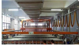
Pattern Plating Machine