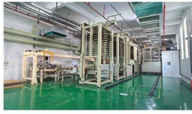
Automatic vacuum press machine