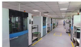
High-speed flying probe machine