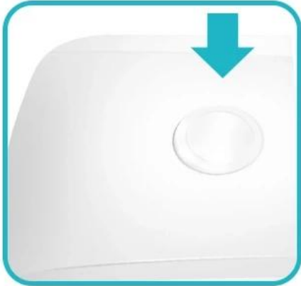
Press the top button, open the cell phone