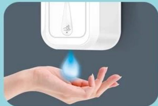
Smart hand sanitizer