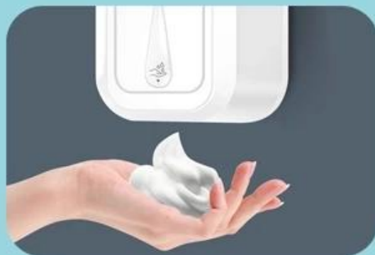
Smart out of bubble