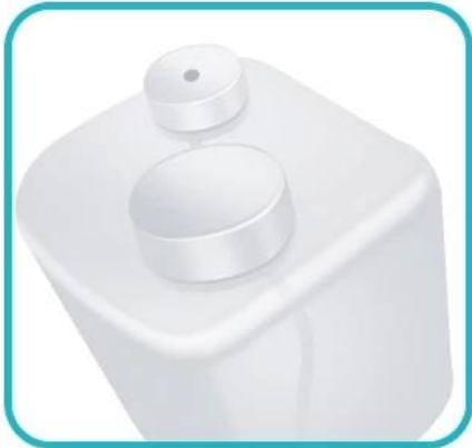
Remove the CAP, the water bottle can be filled with 1100 ml liquid;