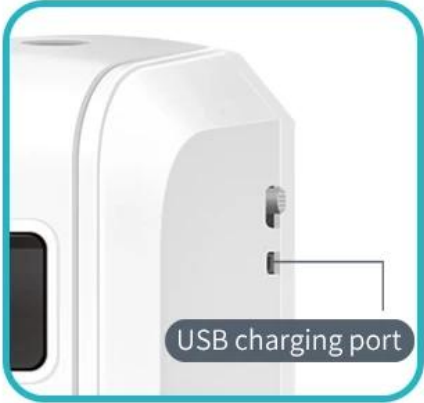
With USB charging cable, built-in 4.5V