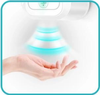
Put your hand under the washing machine and feel the liquid. The distance is 8cm