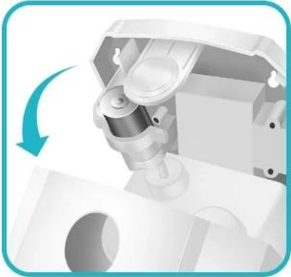
Open the cover in the direction of the Arrow. The cover may be turned nearly 180 for easy removal of the water bottle