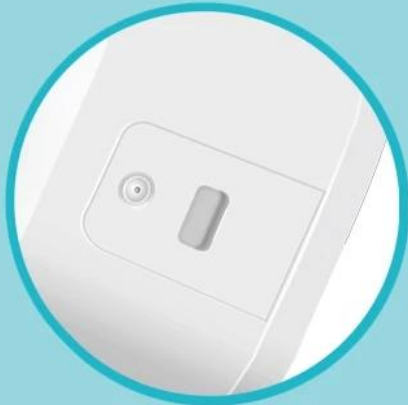
Automatic liquid sensing, position sensing

Sensing distance 5cm, rapid liquid discharge in 0.25 seconds