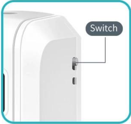
Move the switch to no to start washing the phone