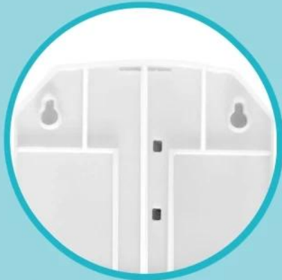
Four grooves can be hung on the wall