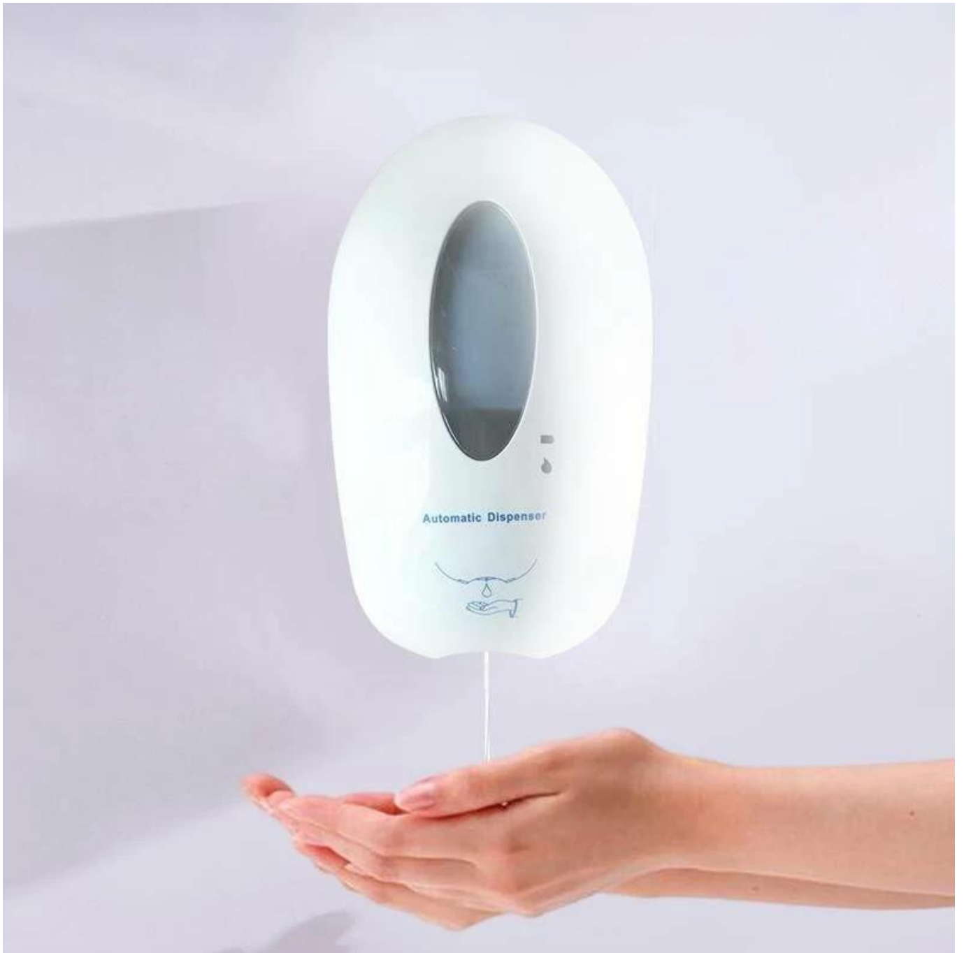
Touchless Stand Foam Soap Dispenser