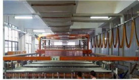
Pattern Plating Machine