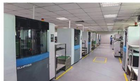
High-speed flying probe machine