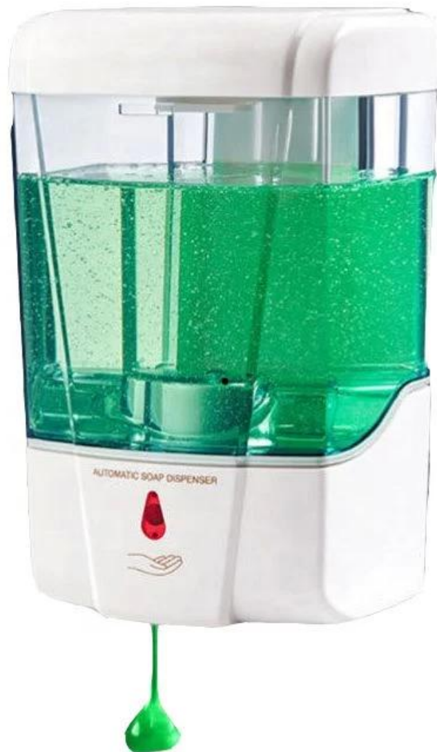
Refillable infrared touchless soap dispenser for hands sanitizer