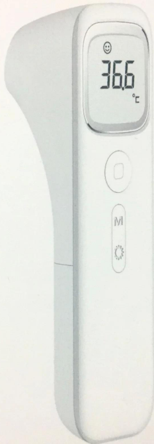
DY-A200 INFRARED THERMOMETER