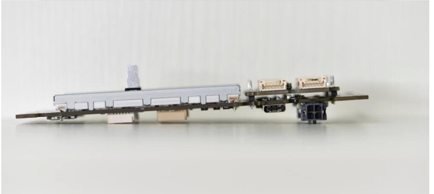
Printed circuit board, high-quality PCBs manufacturer