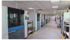
High-speed flying probe machine