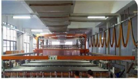
Pattern Plating Machine