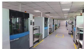
High-speed flying probe machine