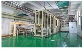
Automatic vacuum press machine