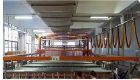
Pattern Plating Machine