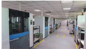
High-speed flying probe machine